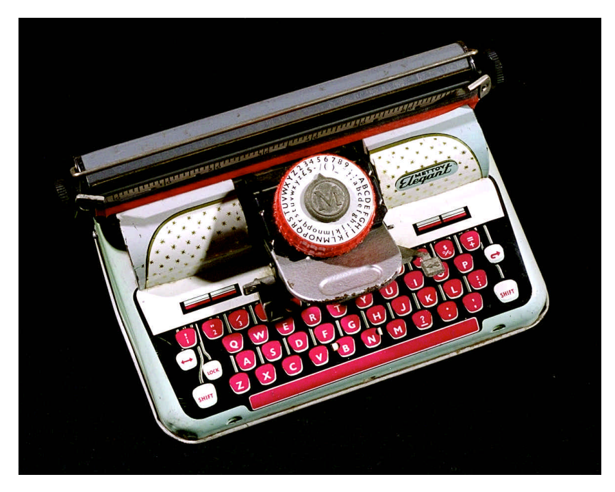
The author's first "word processor." It was given to me by my parents when I was young. As such I am reluctant to disclose the date. However, this Mettoy Elegant timplate, toy typewriter was made during the 1950s in Great Britain.

These remarks are included both as a caution to the beginner and as a homage to those who in the past kept the tradition of the book alive as it grew and evolved to the point where it is today. As you sit at your desk and work through this volume, think of the medie val monks patiently illuminating their manuscripts, the Chinese calligraphers writing their scrolls, the Victorian typesetters composing a page one lead character at a time, and all the other figures in the history of bookmaking, a medium whose fundamental purpose is to ensure that knowledge will persist through time.